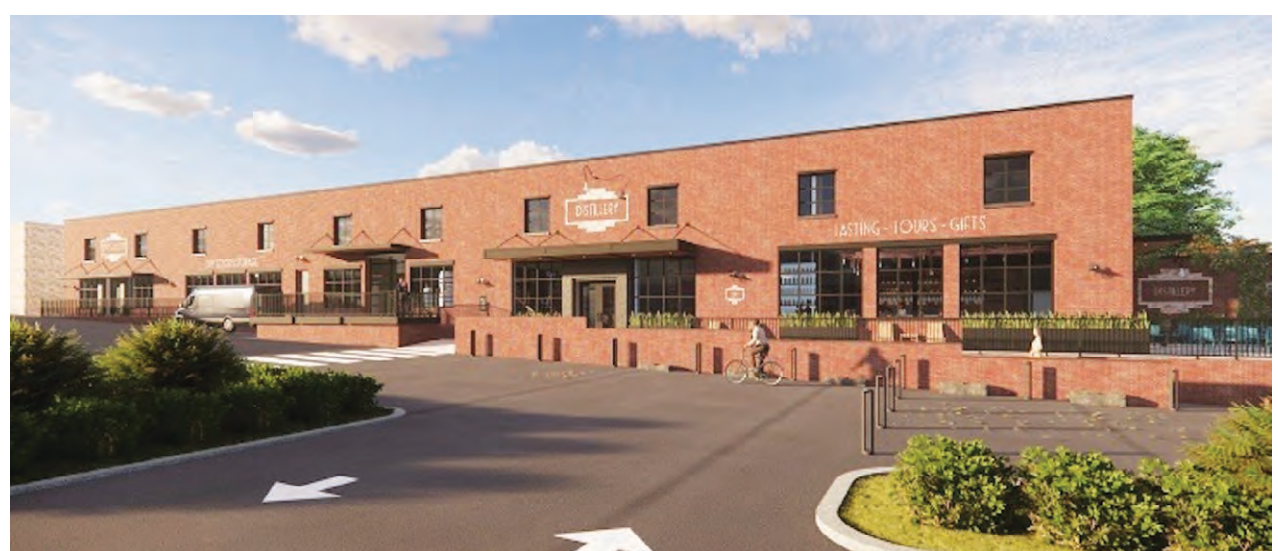
The Blackstone Distillery will be located in the former Keith Dry Goods building.