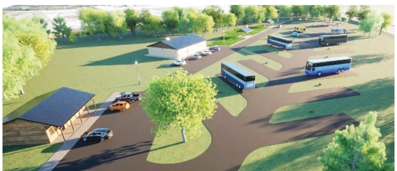
A new campground and ATV trailhead will be built on Elk Mountain.