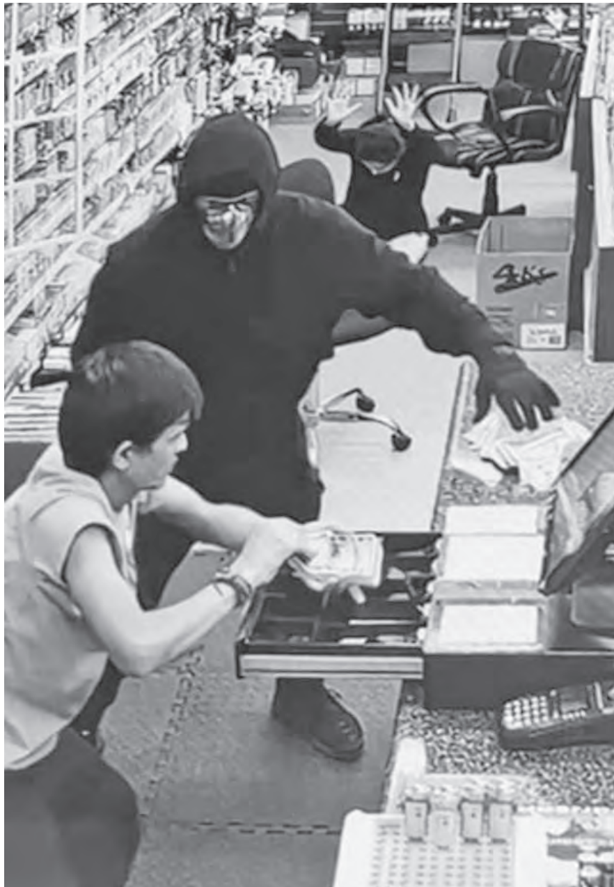
Manchester City Police officers are investigating an armed robbery at Royal Tobacco on old U.S. 421 early Monday morning.

"She thanked me for saving her dad's life," he said. "He's doing a lot better she told me. I'm just glad I was there and able to help him."