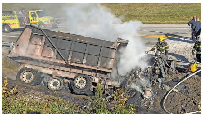
The cab area was completely gone following the fire.