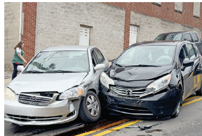
No major injuries were reported from this accident on Courthouse Hill. The silver vehicle was exiting Banker's Aly when it struck the other vehicle.