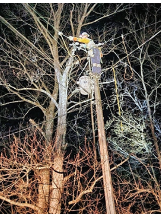
The windstorm Friday night broke numerous poles and power lines throughout the region. Jackson Energy crews have been working around the clock.

Broken poles, downed power lines leave thousands powerless